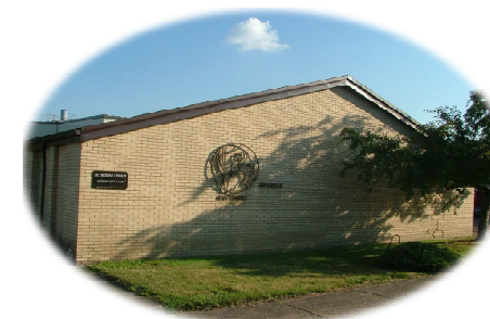
St. Matthias Freeport