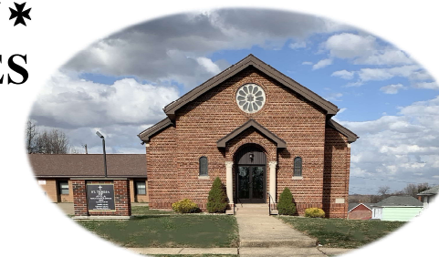
St. Teresa of Avila Cadiz